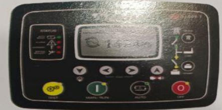
TJ 509-T controller