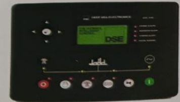
Deep Sea controller